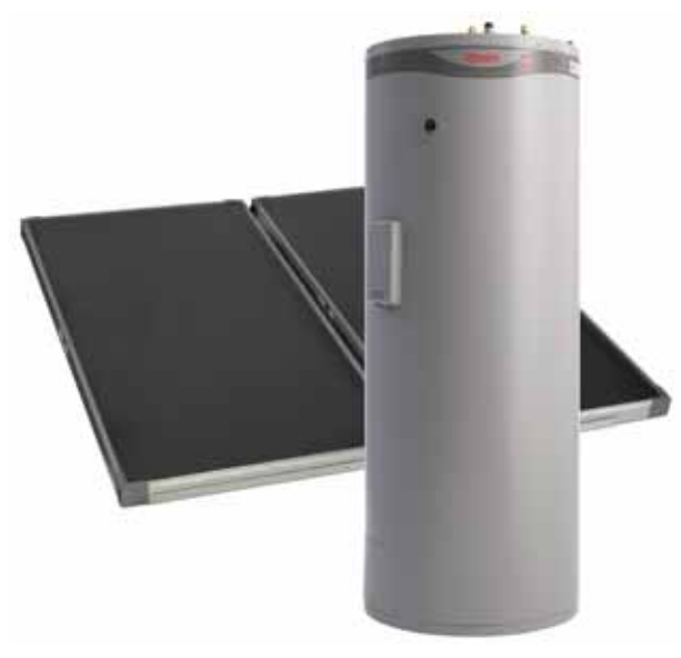
Model No: 591270/2T

Indirect models are designed for frost prone areas and work in much the same way as direct models but rather than heating water 'directly' in the solar collectors, heat exchange fluid with anti-freeze properties is heated. This in turn 'indirectly' heats the water. Indirect heating prevents water freezing and damage to collectors.