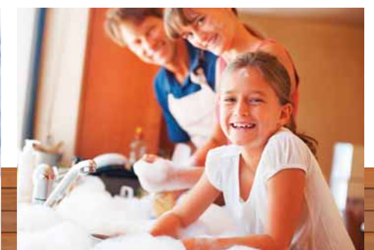
Rheem | You'll be right with Rheem.