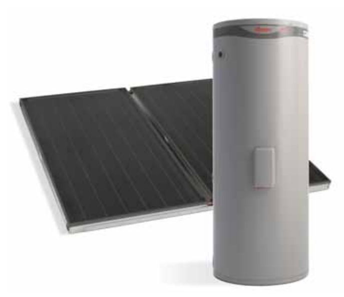
Model No: 511325/2NPT

Solar water heaters work by absorbing energy from the sun's rays in roof mounted solar collectors. This energy is transferred to heat water stored in the storage tank. Ground mounted systems rely on inbuilt pumps to push the water through the system. Typically water passes through channels in the solar collector where the water is heated. As the water moves out of the collector and into the tank, the tank gradually gets hotter until the water reaches its maximum stored temperature.